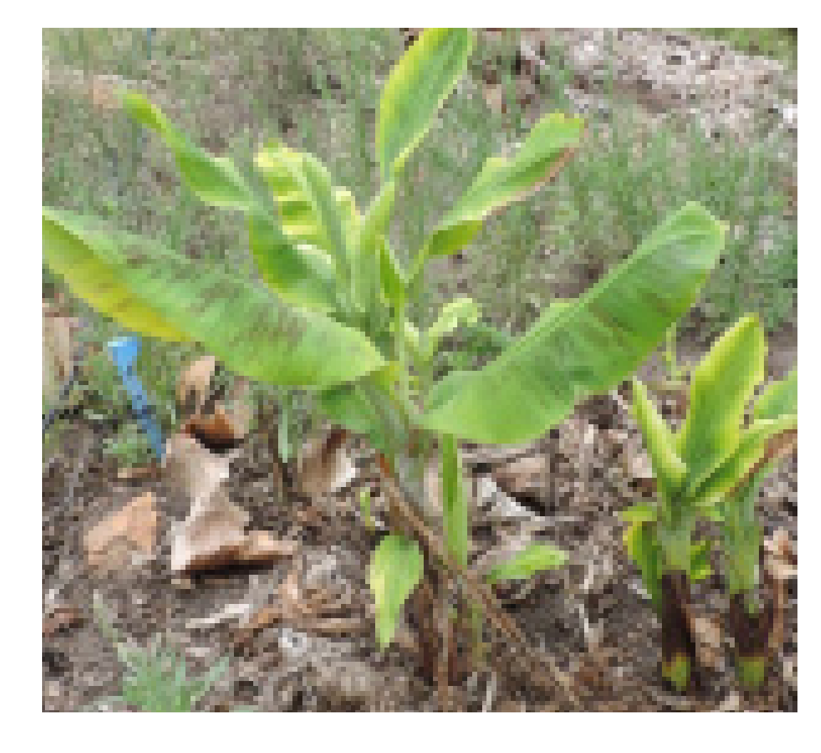
Banana Bunchy Top Virus symptoms (Typical dwarfed, upright growth and bunched at the top)