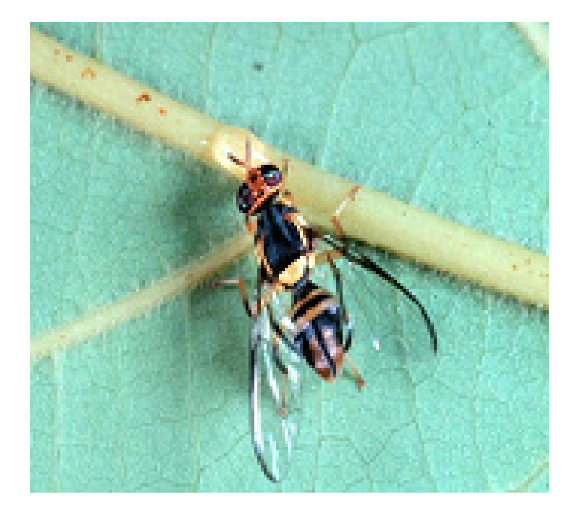
Bactrocera dorsalis.